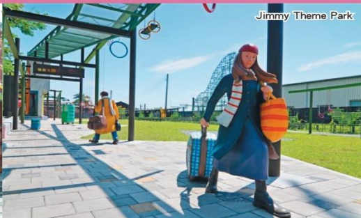
Jimmy Theme Park