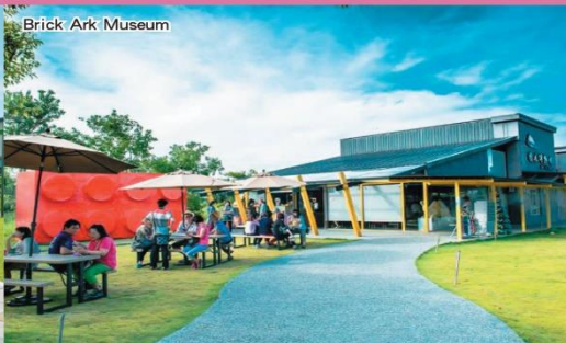
Brick Ark Museum